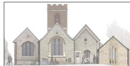
East elevation showing the feature coloured-glass window on the theme of the resurrection

If you are not already aware, the overriding aim of this project is to make our beautiful and historic church fit for purpose in the 21 st century and beyond. A description of the scheme is available on the parish website at: www.teddingtonparish.org/building-aneu