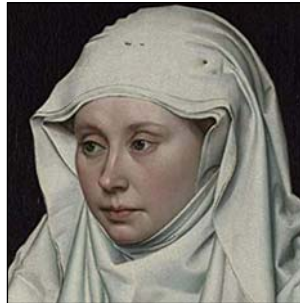
Julian of Norwich

of our troubling times are also found in the 14 th century's considerable political, social and religious turbulence. However, in many ways the meaning of Julian's visions provided