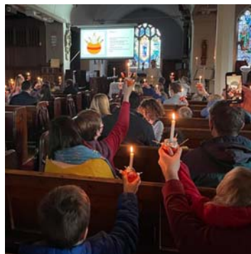
Christingles were enjoyed by all at our 9am Service on Sunday January 30 th as part of our Candlemas celebrations. We raised £400 for The Children's Society in our collections. A big thank you to our local Tesco's for donating the oranges and sweets.