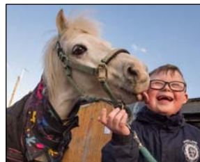
Whizz licking Woody

Since then, we have been on BBC and ITV again, in the national press, and Hello magazine. The Queen has invited us to the Royal Mews. On a serious note, there is a lot of work to do before the stables will be owned by our charity. The priority is to purchase the property, then, when we have no rent to pay, we will be able to offer more subsidised activities for those in need, making riding more inclusive and accessible. Additional donations will be used to buy specialist equipment, such as a ramp and a new horse lorry. We hope