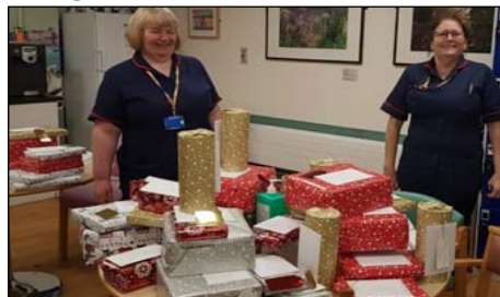
Delivery day on Pamela Bryant Ward