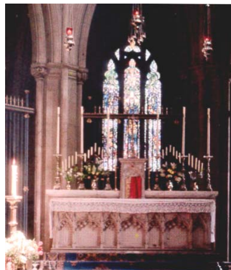
The Altar at St. Alban's

No names were added after WWII. In the years between the church's closure in 1976 and the building's reopening in 1995, vandals broke in and smashed the altar. Thus our parish currently has no memorial, or visible record of those who gave their lives in the two World Wars.