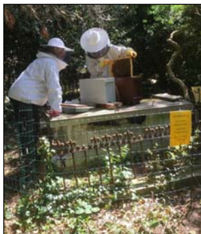
Claudie Godet supervising bee hive activities

The PCC is now considering a proper plan for the maintenance of the church-