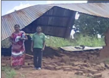
The school in Mozambique and the same building after the Cyclone

has made a terrific start and at a recent assembly I was presented with a cheque for £5,000. Some of this came from donations made by parents and visitors at the Harvest and Christmas events, but an incredible £3,026 was raised by Year 6 (see Year Six Grow a Pound on next page).