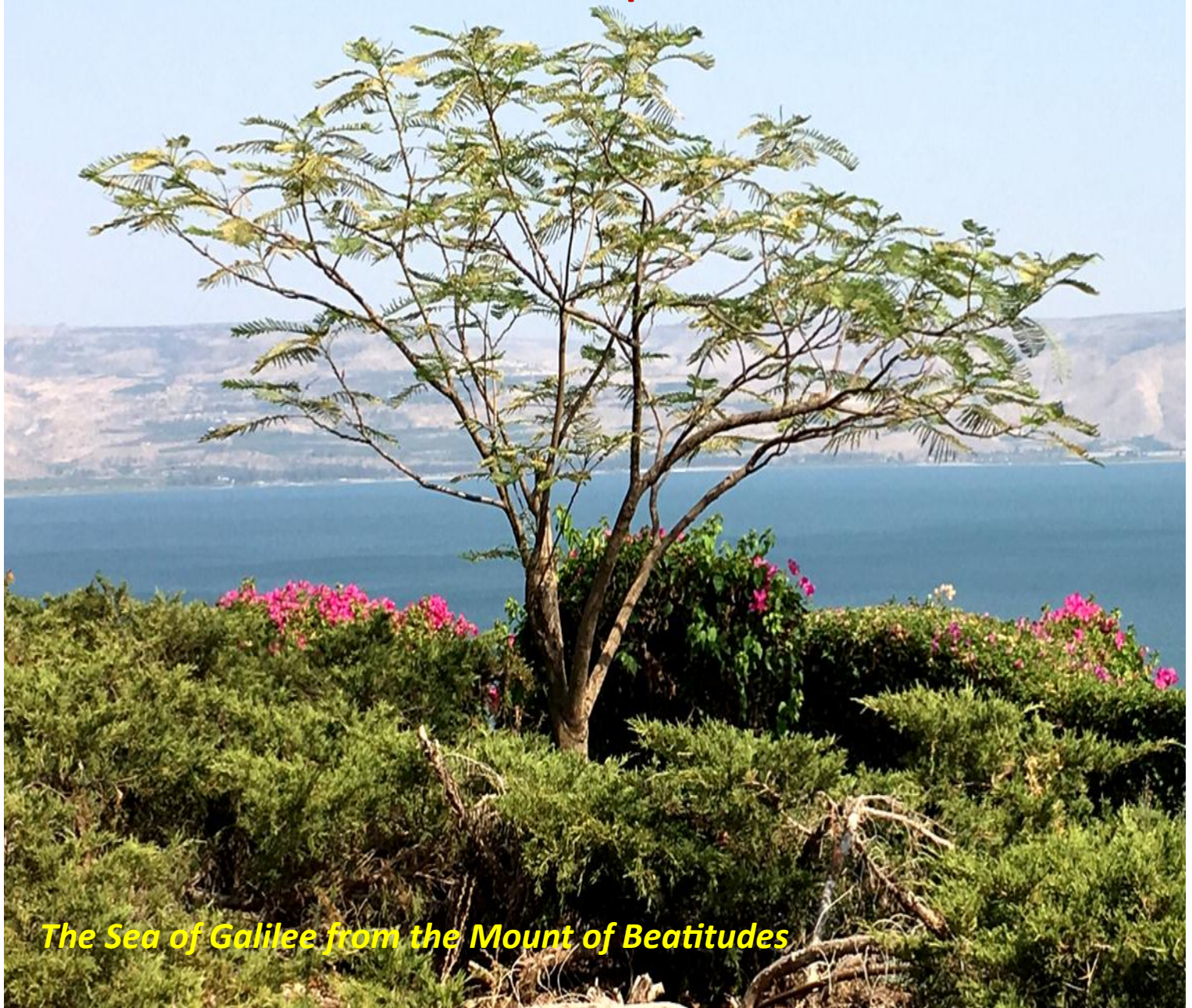
The Sea of Galilee from the Mount of Beatitudes